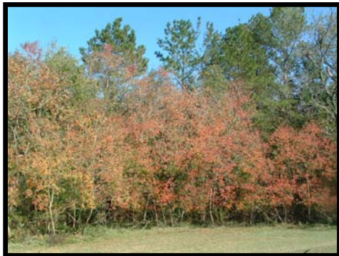
Fall Foliage in Carriage Hills